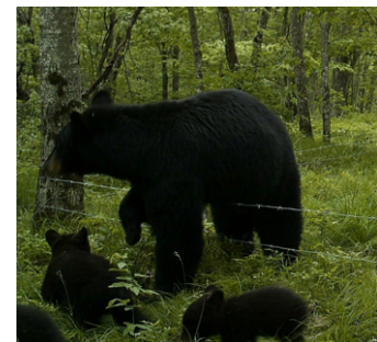
Bushnell Camera Name 57F13°C